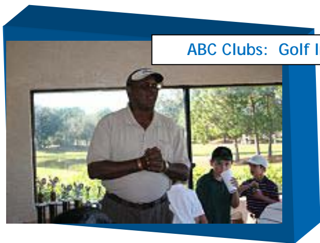
ABC Clubs: Golf Inaugural Tournament