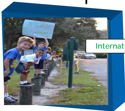
International Coastal Clean-Up